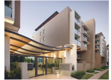
project Leftbank suburb West End units 65 (new) completion 2004 awards 2005 Qld Architectural (Brisbane Regional Commendation) 2005 UDIA Finalist awards (Excellence Large/Medium Density Project)