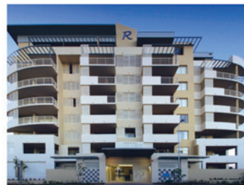
project Riva suburb Indooroopilly units 44 (new) completion 2003