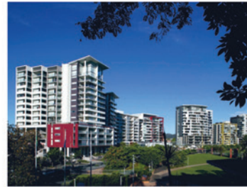
project Parklands suburb Brisbane City units 401 (new) completion 2006 awards 2003 HIA Housing (Marketing Award Winner) 2004 UDIA (Marketing Excellence)