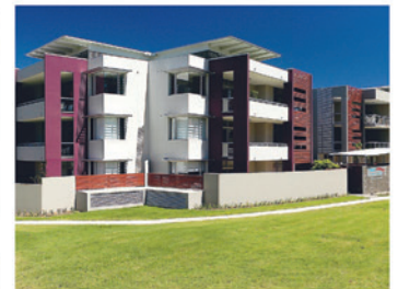
project Encore suburb Toowong units 75 (new) completion 2002 awards 2003 UDIA (Excellence Large/Medium Density Project)