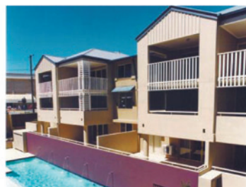
project Verandahs on Vincent suburb Indooroopilly units 34 (new) completion 2001