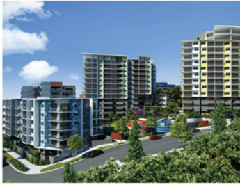
project Urban Edge suburb Kelvin Grove units 380 commencing Late 2011/early 2012 availability Now Selling