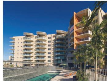
project Allegro suburb South Brisbane units 117 (new) completion 2006