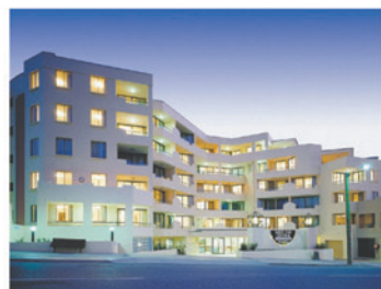
project West End Central suburb West End units 105 (new) completion 2000