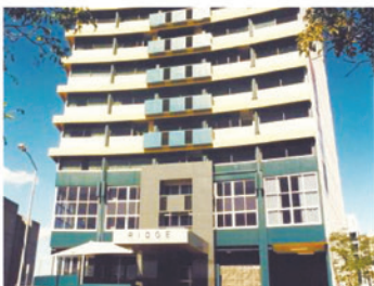
project Ridge on Leichardt suburb Spring Hill units 89 (refurbished) completion 2001