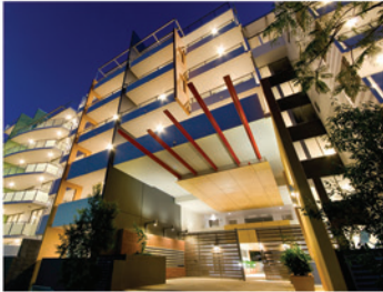
project Tempo suburb West End units 99 (new) completion 2007 availability Now Selling