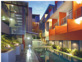
project Viva suburb Fortitude Valley units 44 (new) completion 2004 awards 2005 UDIA Finalist (Excellence Large/Medium Density Project)