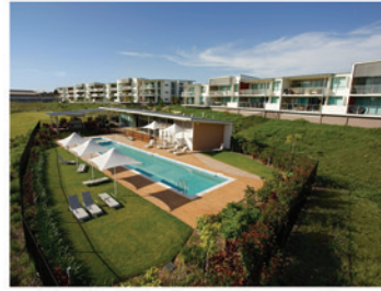
project Parklands at Sherwood suburb Sherwood units 301 availability Now Selling