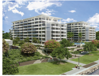
project Waters Edge suburb West End units 221 availability Now Selling