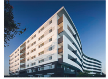
project Flow suburb West End units 83 completion 2007 awards Flow 2008 Project of the Year – Winner 2008 Multiple Housing – Winner 2008 Urban Renewal – Finalist