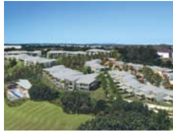
project Parklands at Sherwood suburb Sherwood units 239 commencing 2008 availability Now Selling