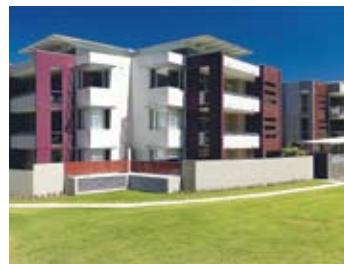
project Encore suburb Toowong units 75 (new) completion 2002 awards 2003 UDIA (Excellence Large/Medium Density Project)