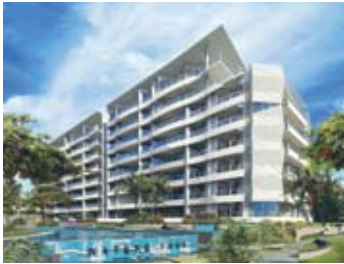
project Waters Edge suburb West End units 221 commencing 2009 availability Now Selling