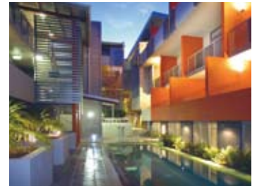
project Viva suburb Fortitude Valley units 44 (new) completion 2004 awards 2005 UDIA Finalist (Excellence Large/Medium Density Project)