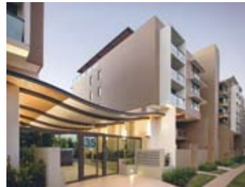
project Leftbank suburb West End units 65 (new) completion 2004 awards 2005 Qld Architectural (Brisbane Regional Commendation) 2005 UDIA Finalist awards (Excellence Large/Medium Density Project)