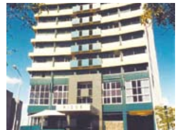
project Ridge on Leichardt suburb Spring Hill units 89 (refurbished) completion 2001