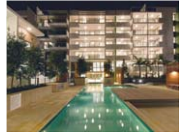
project Tempo suburb West End units 99 (new) completion 2007 availability Now Selling