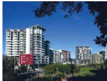
project Parklands suburb Brisbane City units 401 (new) completion 2006 awards 2003 HIA Housing (Marketing Award Winner) 2004 UDIA (Marketing Excellence)