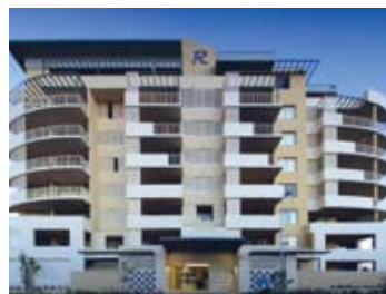
project Riva suburb Indooroopilly units 44 (new) completion 2003