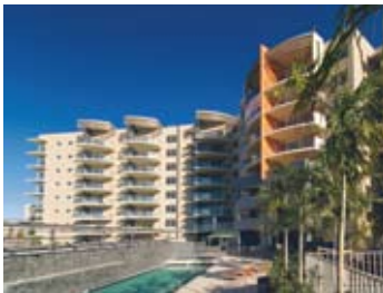
project Allegro suburb South Brisbane units 117 (new) completion 2006