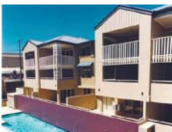
project Verandahs on Vincent suburb Indooroopilly units 34 (new) completion 2001