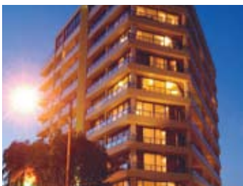
project The Summit suburb Spring Hill units 72 (refurbished) completion 2003