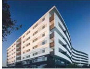
project Flow suburb West End units 83 (new) completion 2007 awards Flow 2008 Project of the Year – Winner 2008 Multiple Housing – Winner 2008 Urban Renewal – Finalist availability Now Selling