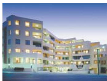
project West End Central suburb West End units 105 (new) completion 2000